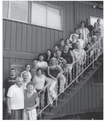
Jones Family Bunch

Like Patty, you can make a gift in your estate plan that expresses your values and supports the Church. To learn more, please contact Margaret Hampton at mhampton@rcdb.org or (208) 342-1311, Ext. 5139.